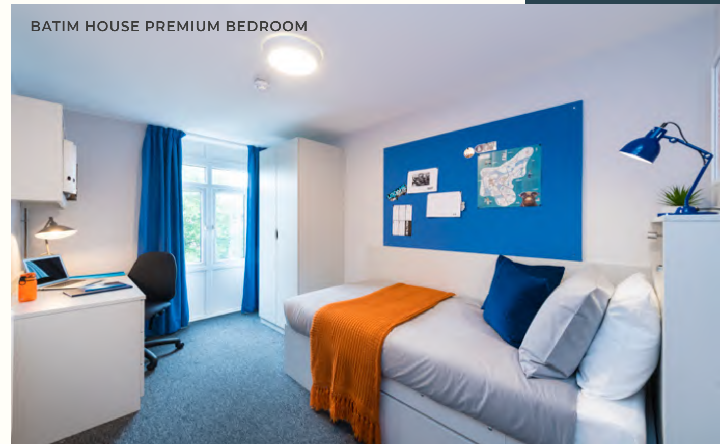
BATIM HOUSE PREMIUM BEDROOM